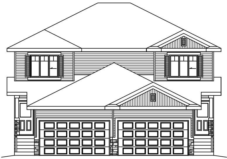
ELEVATION A- STANDARD

*1364 sq. ft. - 3 Bedroom - 2.5 Bathrooms - 20' Pocket