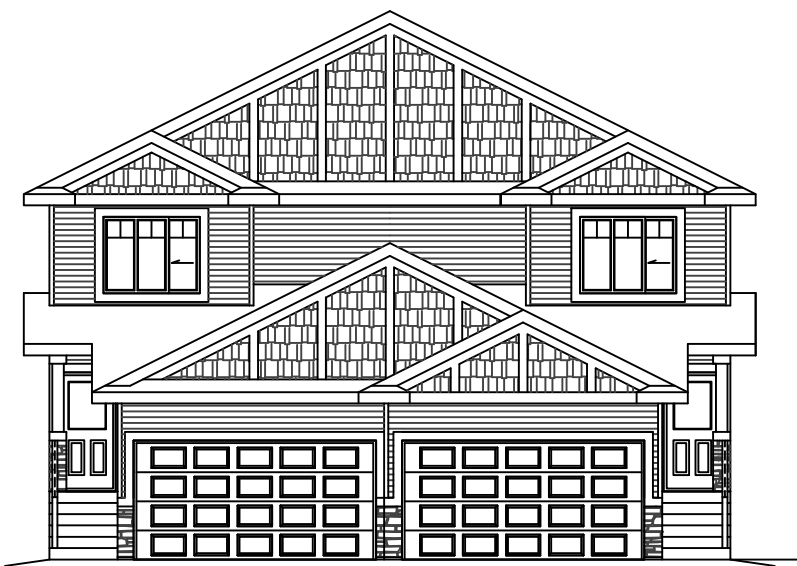
ELEVATION C- UPGRADE