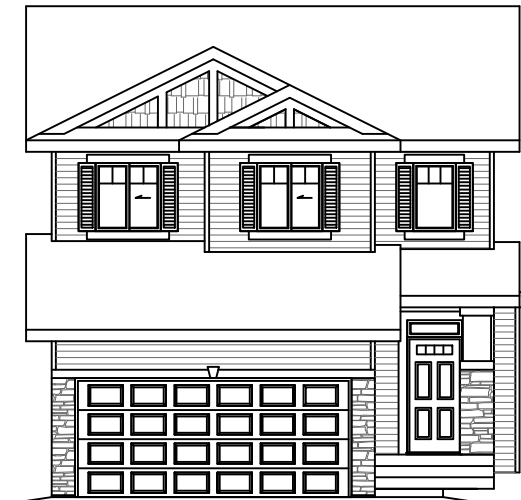
ELEVATION B - STANDARD