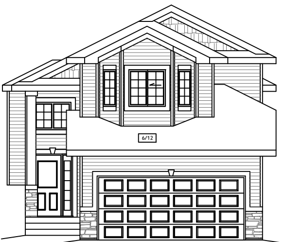
ELEVATION A- STANDARD

1427 sq. ft. - 3 Bedroom - 2 Bathrooms - 26' Pocket