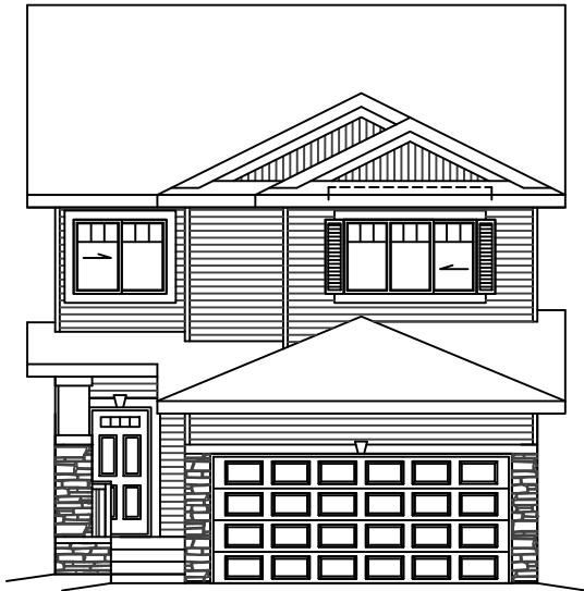
ELEVATION B- STANDARD

OPTIONAL FLEX ROOM FOR BEDROOM #2 OWNER SUITE- 8" COFFER CEILING