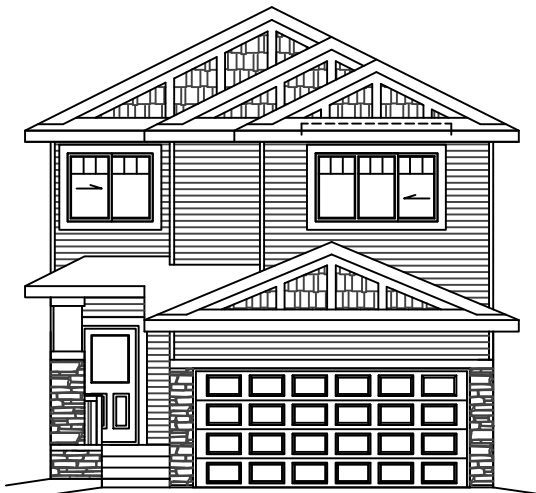
ELEVATION C- UPGRADE

9'-1" CEILING THROUGHOUT, EXCEPT WHERE NOTED