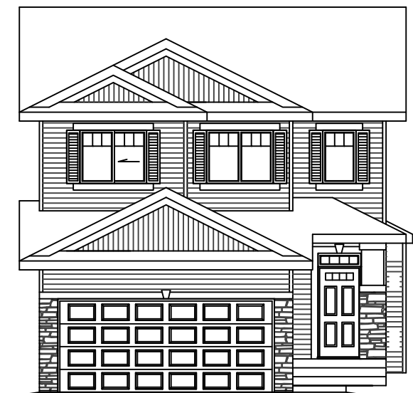
ELEVATION B- STANDARD