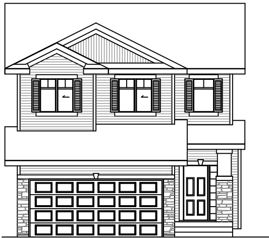
ELEVATION B- STANDARD