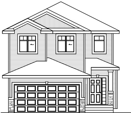
ELEVATION A- STANDARD

1916 sq. ft. - 3 Bedroom - 2.5 Bathrooms - 26' Pocket