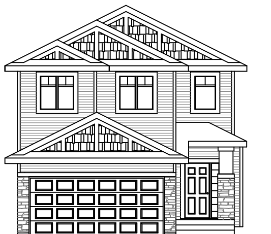
ELEVATION C- UPGRADE

9'-1" CEILING THROUGHOUT, EXCEPT WHERE NOTED