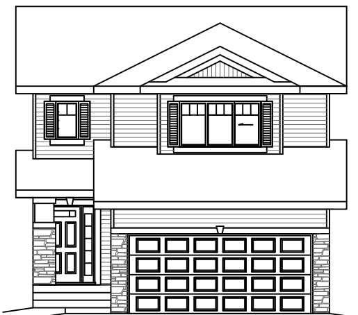
ELEVATION B- STANDARD